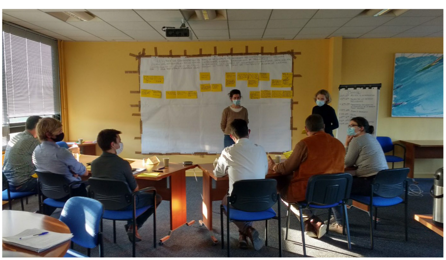
Stakeholders of the ROADMAP French Living Lab building a holistic vision of problems preventing improved antimicrobial use in the poultry and pig sectors © Sophie Molia.

Animal production. There were also contrasts in terms of the economic situation and orientation of the livestock production systems studied. For example, in Denmark, approximately 90 per cent of pig production is exported and maintaining low pork prices is a high priority to remain attractive on the international market. At the same time, AMU is low compared to competitors on the export market so further reduction will be more likely to cost money than save money. In this context of low AMU compared to other countries with similar industrialised pig production, the ban on medical zinc oxide in 2022 could increase the pressure on costs in an already fragile industry resulting in more pig farms going bankrupt.