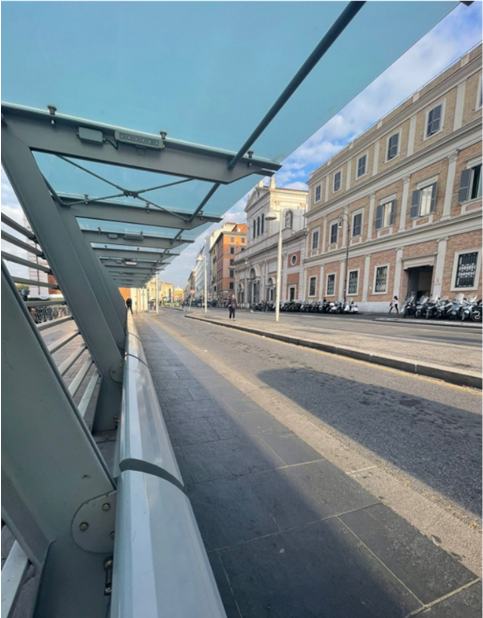
Figure 1: Leaning benches in Rome, Italy – picture taken by G. Melloni.

bins are a source of food and the waste found there can be recycled and “traded in for a modest income” (Rosenberg 2017). But if this access is no longer viable, then this is no longer an opportunity to find something to eat or something that can be exchanged for money.