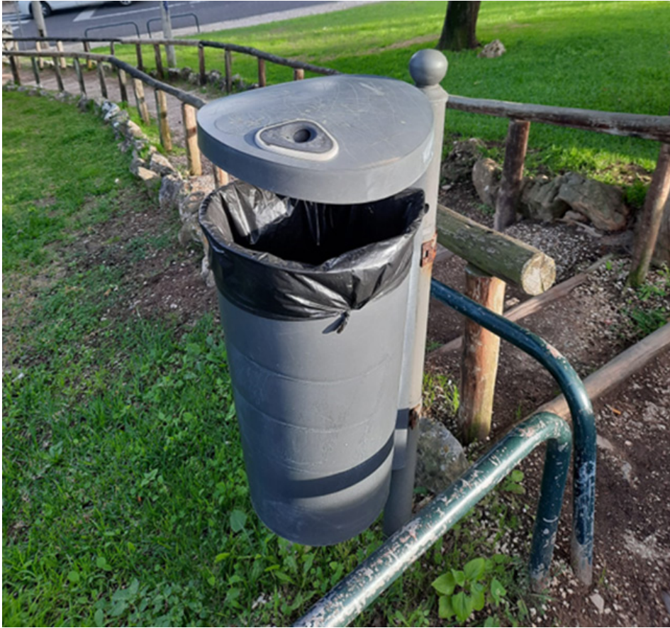
Figure 2: Garbage bin with a small opening in Cascais, Portugal – picture taken by C. Ferreira.

Cara Chellew (2019) identified other elements used to prevent people from sleeping in public spaces, such as anti-skate elements, but what is more interesting about her analyses is what she calls “ghost amenities.” The author is referring to “washrooms and water fountains” commonly present in public spaces, but that are “absent due to disrepair, reduced operation, or intentional omission” (Chellew 2019: 23). Their non-existence jeopardizes the already precarious life of a homeless person since they rely on these elements as a way of keeping themselves washed and clean. Other elements mentioned by several authors include spikes used in benches, on walls, and on doorsteps (Figure 3) to prevent people from sleeping there and “automated water sprinklers in parks and other spaces homeless or indigent people are known to inhabit” (Petty 2016: 74).