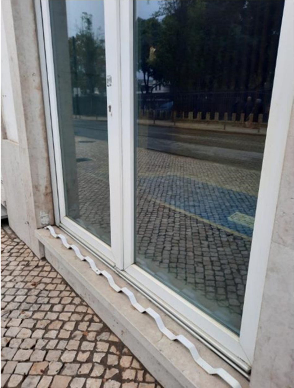
Figure 3: Metallic structure on the window frame in Lisbon, Portugal – picture taken by C. Ferreira.