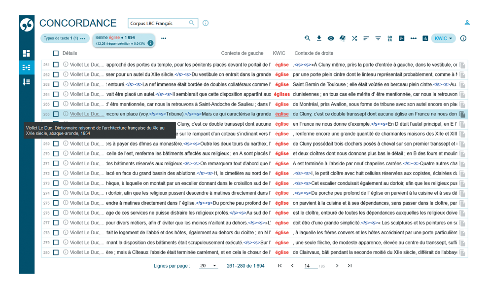
Figure 1: Concordance hits for the lemma église in a specialised text from the French LBC Corpus.

such as Bellitalie.org); literary texts (writers' correspondence, fiction, such as Mme de Stael's novel Corinne ou l'Italie); technical texts (art history textbooks, art criticism and specialist dictionaries of Fine Arts, such as Viollet Le Duc (1854), Dictionnaire raisonné de l'architecture française du XIe au XVIe siècle (cf. Figure 1).