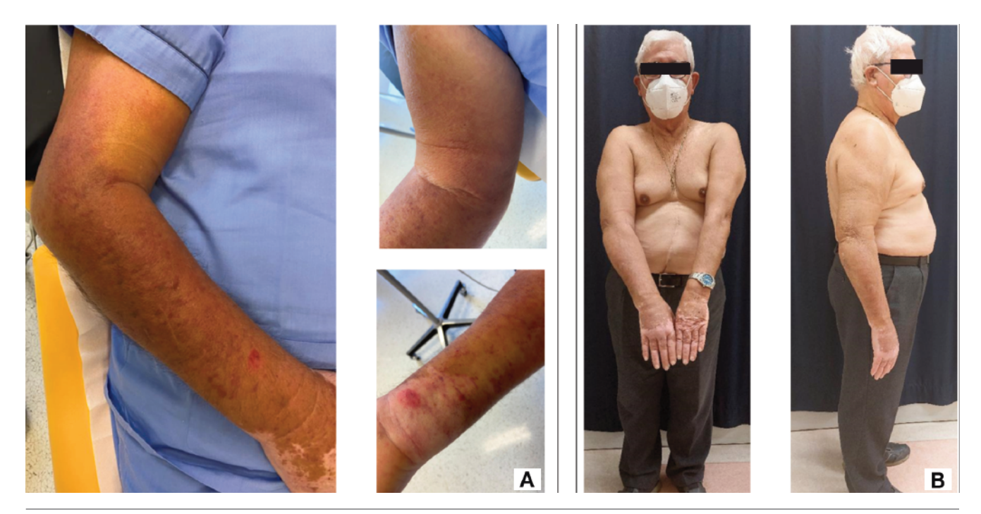
Figure 2. A) Patient's right arm. Note the arm size, which was more than twice the contralateral, causing the patient difficulties in flexing the arm and swelling, with the appearance of orange peel skin; B) patient after six months of treatment with methotrexate and the use of the elastic compression device. Note the significant reduction in the volume of the affected arm and the skin appearance, now much more similar than the unaffected one.