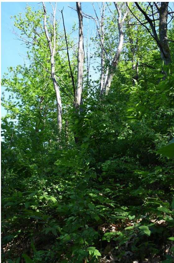
Fig. 3 A recent foci of ink disease but with already growing natural chestnut regeneration

Isolation from collar and root infected tissues by using selective media (PARNPH) confirmed the presence of Phytophthora xcambivora from symptomatic chestnut trees (RA% = 6%) positive to qPCR assay. In addition, from the same collar samples, isolation on