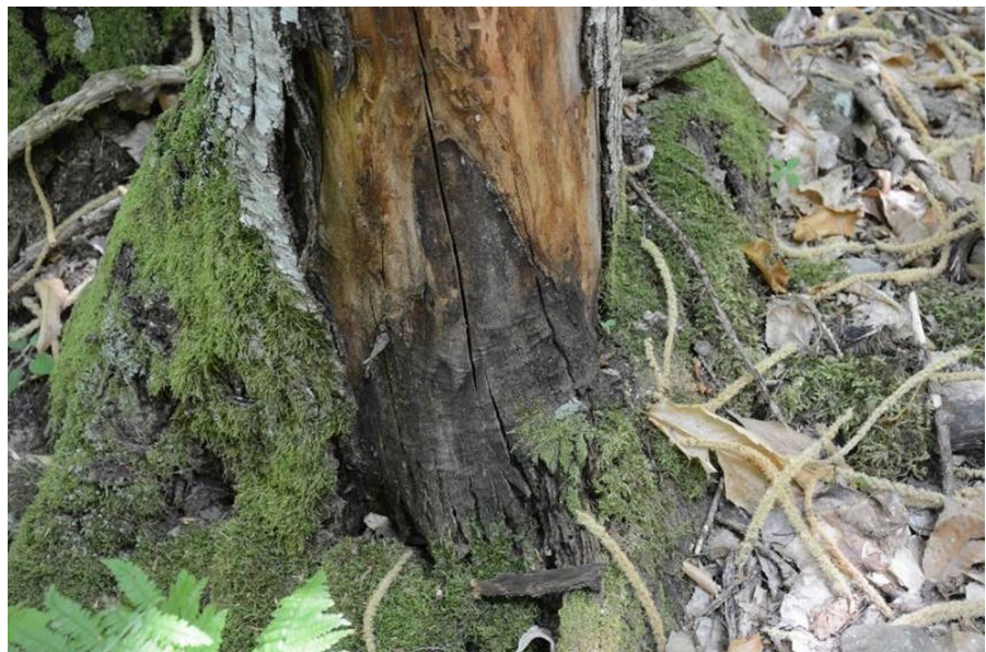
Fig. 2 Basal part of Castanea sativa dead tree with still evident sign of a possible ink disease attack: a dark-brown flame shaped lesion under bark and absence of resprouting

At 20 sites, we recorded only a single tree or coppices dead from ink, while in the other seven sites, small groups of plants (from 2 to 10) were affected. Attack on more than 10 plants occurred in only one area. In 20 areas, the attacks appeared very localized, while in six, there were few stripes or spots. In