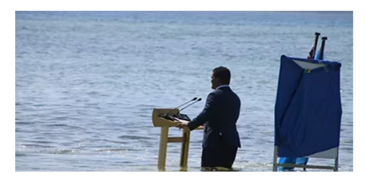
Figure 2. COP 26 'Underwater speech' delivered by Tuvalu's former foreign minister

On that occasion, the former foreign minister delivered his speech in a video message released online through social platforms, of which Figure 2 provides a still image, standing knee-deep in seawater in an area that, as he mentioned, used to be dry land. The unusual setting in which this communicative event took place drew considerable attention to the island's struggle against rising sea levels worldwide.