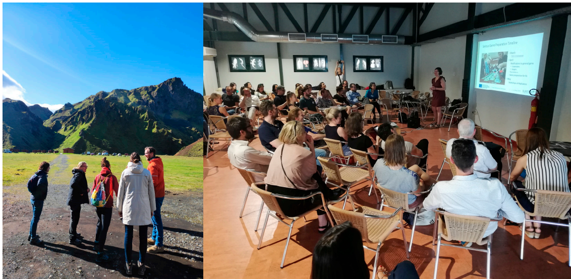
Figure 3. The knowledge exchange activities (photo credit: Åberg, 2022; RURITAGE, 2019).

The results are presented according to the planned knowledge exchange methodology. This section describes the series of events (see Figure 3) together with the results from the surveys.