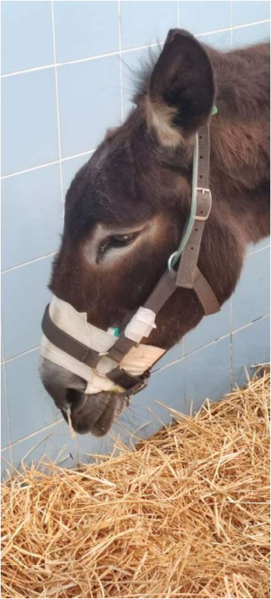
375 376 Figure 3 The 23-years-old donkey on admission.