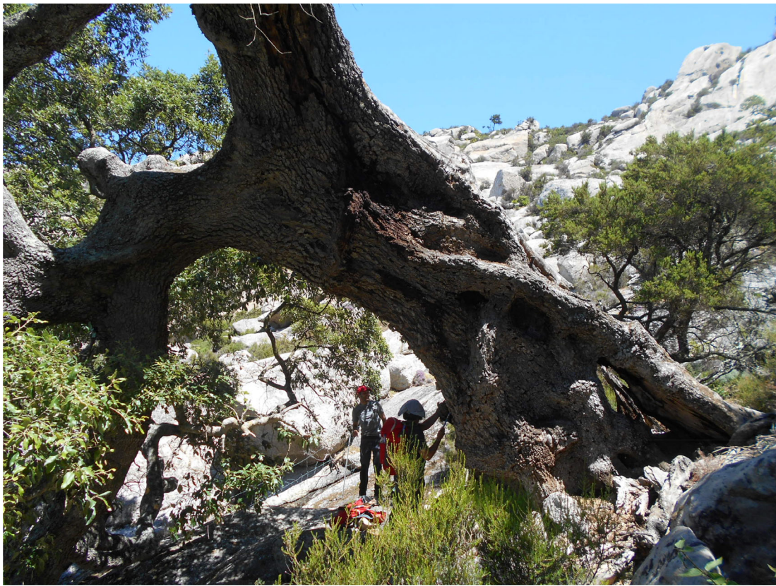
FIGURE 1 One of the old holm oaks of Montecristo during wood sampling aimed at radiocarbon dating (photograph by Goffredo Filibeck, 27 June 2018). This was the individual with the largest diameter (185 cm), but not the oldest age (cf. Figure 2).

(Piovesan & Biondi, 2021). Conversely, long-aged trees are extremely rare in coastal Mediterranean ecosystems, because of the long history of coppicing, burning and other types of anthropogenic disturbance. Moreover, dating evergreen warm-temperate trees (the dominant species in the coastal vegetation belt) is a complex task due to the plasticity of intra-annual growth patterns (Campelo et al., 2021) and rotted or hollow trunks.