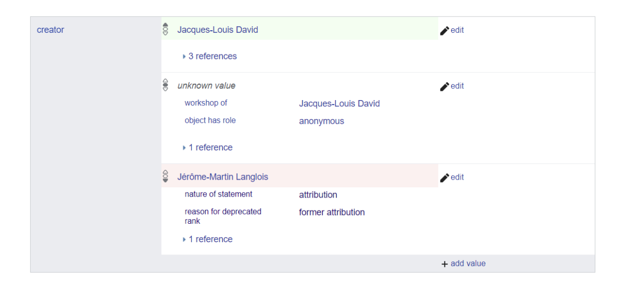
Figure 1: Concurring attributions concerning Napoleon crossing the Alps in Wikidata

approaches to EWA and benchmarks adopted in the literature for their evaluation. In section 3 we briefly introduce and compare conjectures as an alternative method to represent EWA statements in addition to existing proposals such as RDF reification, RDF star, and others. In section 4 we discuss the dataset and the metrics used for our comparison of the various EWA approaches, and in section 5 we analyze our findings. In section 6 we discuss the results before drawing some conclusions in section 7.