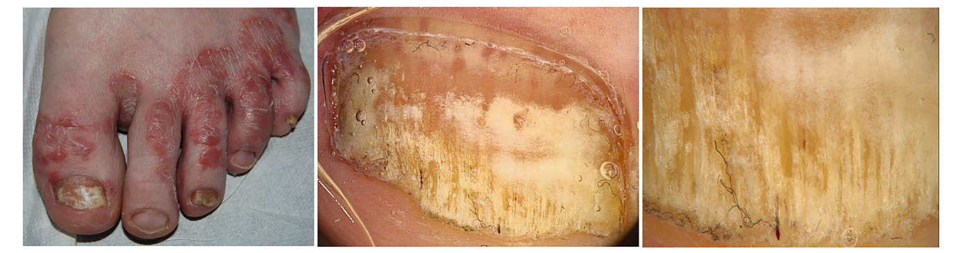
FIGURE 4 Clinical and dermoscopic (10× and 40× magnification) images of Trichophyton interdigitalis infection: the presence of white and yellow with patterns jagged and striae.

Lastly, being multicentric our study reduces patient selection bias, even if sample size is still small to draw definitive conclusions. Further larger studies are needed to corroborate our results.