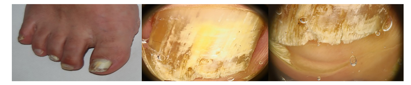
FIGURE 1 Clinical and dermoscopic (10x and 40x magnification) images of Trichophyton rubrum infection: the presence of both white colour and ruin pattern at onychoscopy reached 100% specificity for T. rubrum infection.