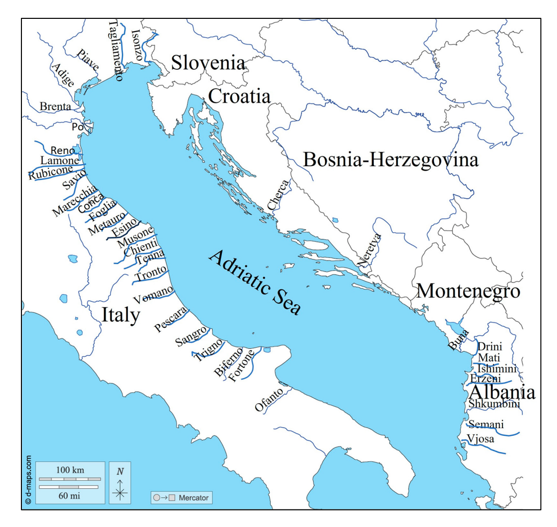
Figure 2. Map of the Adriatic coast showing the locations of the main rivers and streams that flow into the Adriatic Sea. The map was downloaded from the d-maps.com website http://www.d-maps.com (accessed on 3 January 2024) with subsequent modifications applied.

Drini, Mati, Ishimi, Erzeni, Shkumbini, Semani, and Vjosa Rivers, discharging a total of about 1250 \text{ m}^3 \text{s}^{-1} into the basin [43,55] (Figure 2).