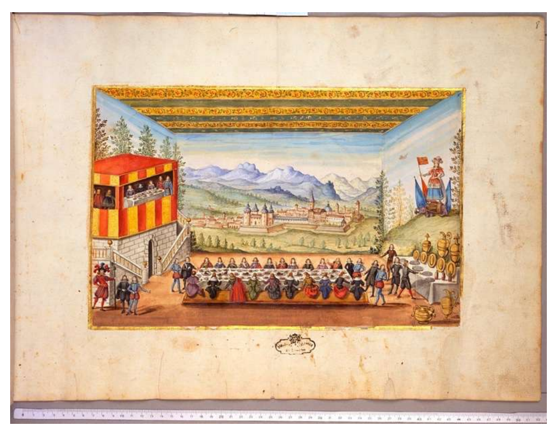
Fig. 1. Giovanni Tommaso Borgonio, Il Dono del Re de l'Alpi , n.d. [second half of the seventeenth century], fol. 8r. Pencil and gouache on paper. Ministero della Cultura, Biblioteca Nazionale Universitaria di Torino.

Gently sloping hills in pale green with slate-blue and gold pen hatchings embrace the city of Turin, capital of the Savoy Duchy, in a large drawing currently held at the National Library of Turin. In the background, the color fades from greenish-blue to almost white as the slopes flanking the valley become steeper and the Alps starts to rise. This view of Turin seen from the east, the hills rising behind the city, and an excerpt of the Alpine chain is actually an image within an image. As documented by the drawing, this landscape was in fact painted on the largest wall (or, more likely, a backdrop hung on that wall) of one of the halls in the Castle of Rivoli, near Turin, for an elaborate and unusual spectacle staged in 1645.