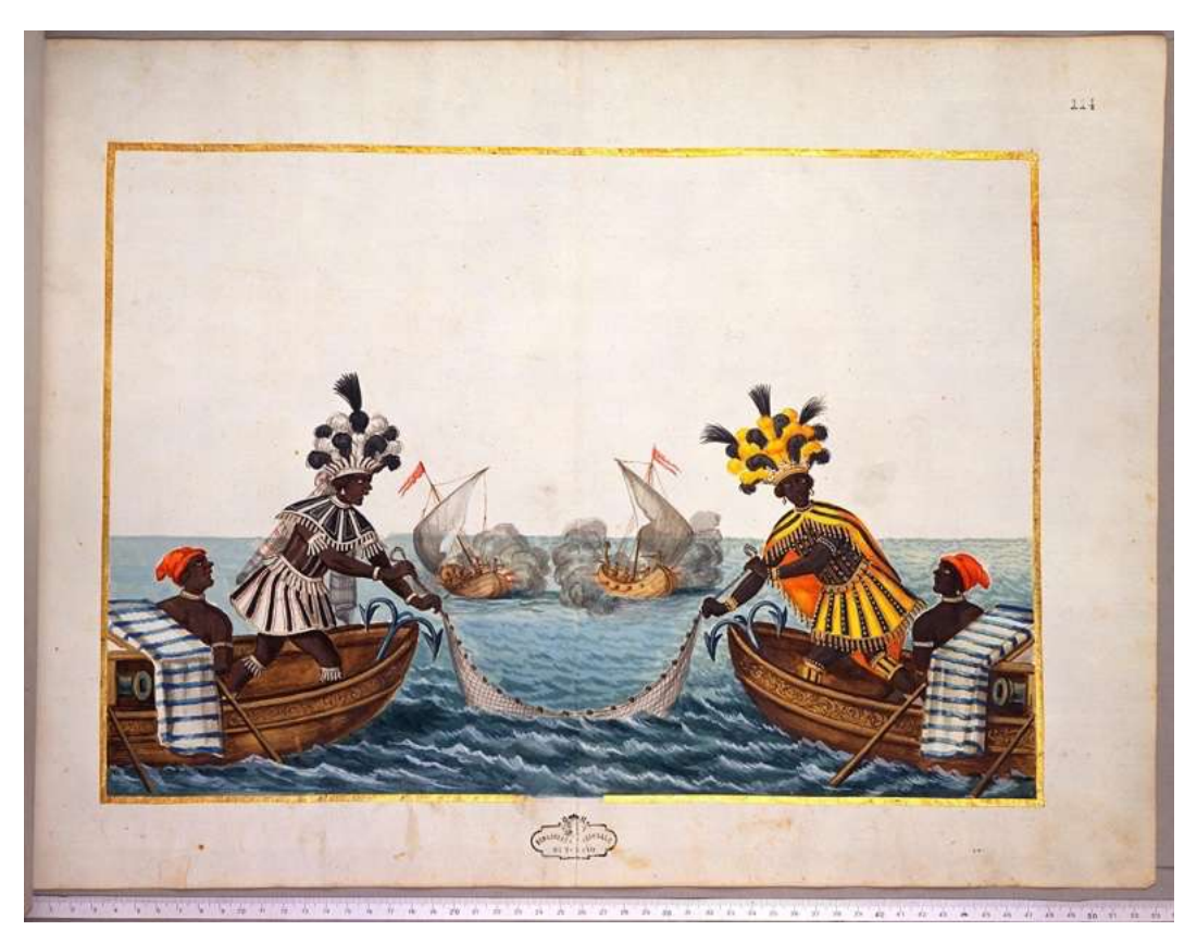
Fig. 5. Giovanni Tommaso Borgonio, L'Unione per la peregrina Margherita reale e celeste , n.d. [second half of the seventeenth century], fol. 114r. Pencil and gouache on paper. Ministero della Cultura, Biblioteca Nazionale Universitaria di Torino.

This technique consisted of a rope with a stone tied to one end, the stones functioning to hold the divers deep under the water while other workers on the canoes used the ropes to lift the divers up once they had collected the oysters<sup>39</sup>. Once again, the bodily movements were designed to mimic all of these activities of fishing, cleaning, and eating, thus evoking in the spectators' minds the journeys and transformations pearls underwent from seabed to land markets, from a raw to a polished state, from hand to hand. Unlike all the other spectacles described above, however, L'Unione also touched on further issues, such as the brutal social and ecological repercussions of this resource extraction and circulation. For instance, two widows from the Gulf of Paria hinted at the extremely dangerous conditions