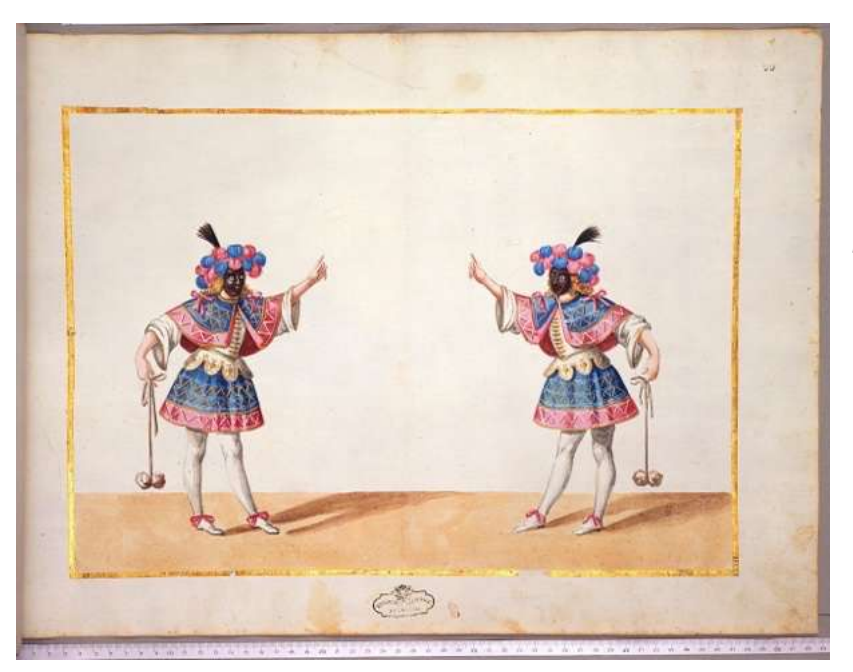
Fig. 4. Giovanni Tommaso Borgonio, L'Unione per la peregrina Margherita reale e celeste, n.d. [second half of the seventeenth century], fol. 99r. Pencil and gouache on paper. Ministero della Cultura, Biblioteca Nazionale Universitaria di Torino.

Secondly, this ballet records contemporary fascination with the geographic distribution of pearls in the world: deposits known from ancient times, as the Persian Gulf and coastal area around the Bay of Bengal, were mentioned together with relatively new sites such as the ones off the east coast of Venezuela. At the end of the spectacle, however, all the pearls "extracted" from these different seas ("estratte da diversi mari") converged in the city of Turin<sup>37</sup>. Embedded throughout this critical source is also a marked curiosity about foreign labor regimes and the chain of value construction: namely, how pearls were fished using a variety of accoutrements, how they were cleaned to enhance their color and prepare them for sale to Europeans (using salt, mortars, and even more bizarre methods such as ingestion by pigeons), and how they were mounted in jewelry or thrown away to consume only the cooked flesh of the mollusks. Of these fishing tools, one of the drawings displays two characters holding an imaginative version of the stones and ropes, a practice also documented by Jan van der Straet in his series Venationes Ferarum, Avium, Piscium<sup>28</sup>.