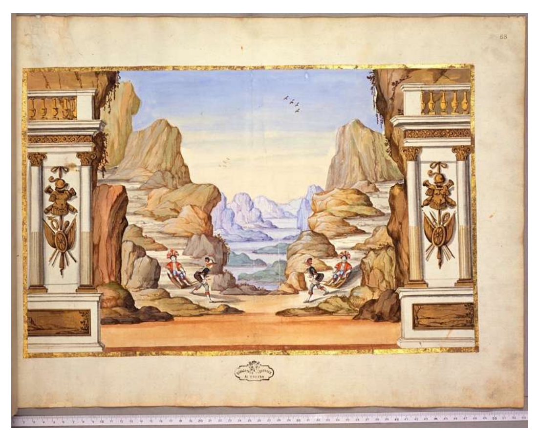
Fig. 3. Giovanni Tommaso Borgonio, La Primavera trionfante sull'Invern o, n.d. [second half of the seventeenth century], fol. 68r. Pencil and gouache on paper. Ministero della Cultura, Biblioteca Nazionale Universitaria di Torino.

would like to briefly delve into is the scenography depicting the Mont Cenis pass.