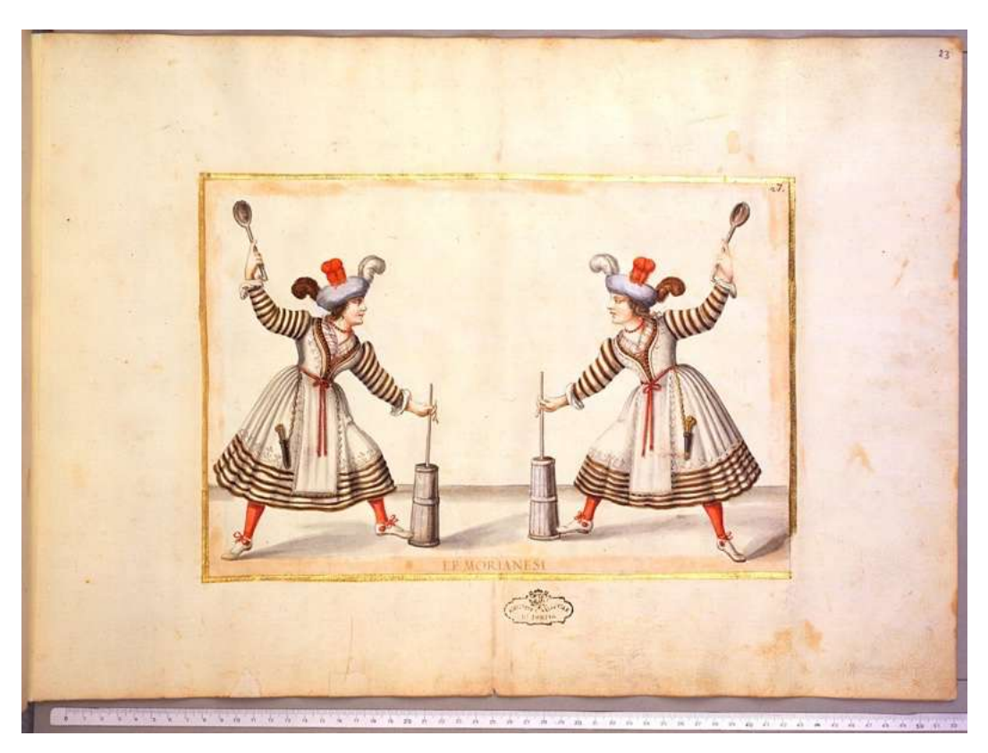
Fig. 2. Giovanni Tommaso Borgonio, Il Dono del Re de l'Alpi , n.d. [second half of the seventeenth century], fol. 23r. Pencil and gouache on paper. Ministero della Cultura, Biblioteca Nazionale Universitaria di Torino.

performers thus played the part of game hunters, milk curdlers, grain reapers and threshers, grape harvesters, fishers, and sellers of scented waters, in that order<sup>13</sup>. The two female milk curdlers from the Alpine Maurienne valley, for instance, entered the scene with a butter churn and proveeded to plunge the churning stick up and down to imitate the act of transforming cream into butter. "New shapes I imbue with motion", each of them sung while beating the rhythm with a wooden spoon<sup>14</sup>.