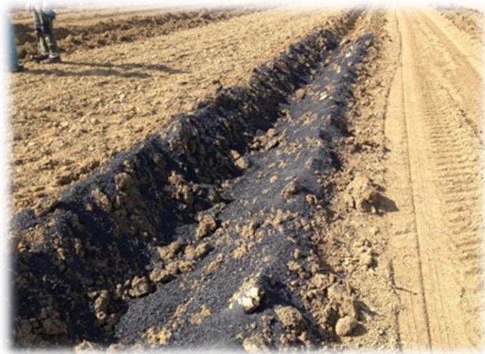
Figure SM1. Example of furrows filled with biochar, before of shoot transplanting.