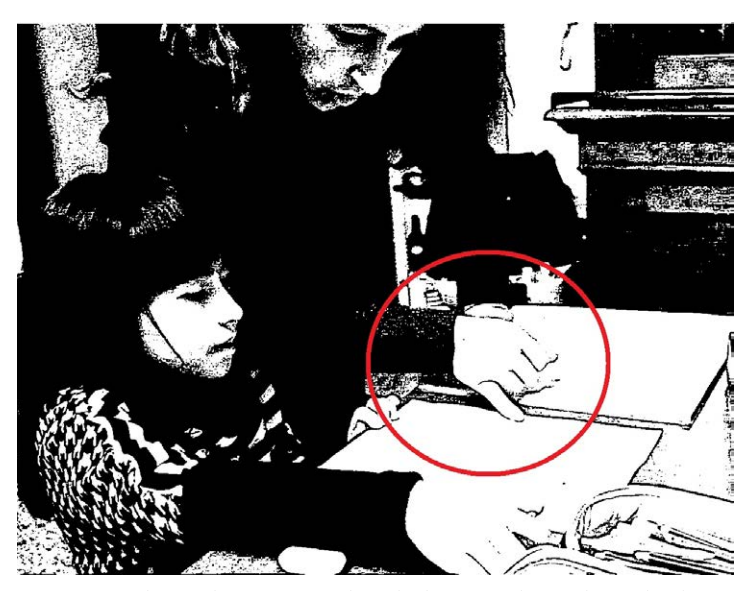
Fig. 3: The mother points to the calculation in the math notebook

così:h e domhh.ani (lo) correggerà il maestro marcoh£