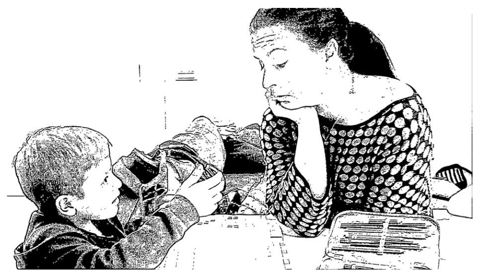
Fig. 2: The mother makes a doubtful facial expression