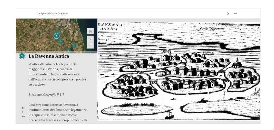
Figure 3, DARE-UIA, Approdo Comune, Storymap Origine del Candiano