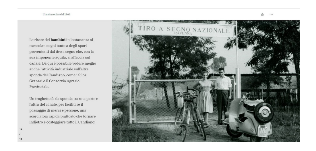
Figure 4, DARE-UIA, Approdo Comune, Storymap Una domenica del 1963