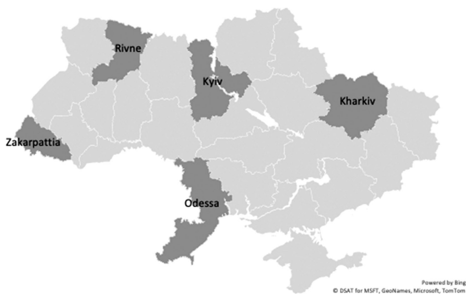
FIGURE 1 Map of Ukraine representing the study Oblasts where the Knowledge, Attitudes and Practice on ASF was conducted

Oblasts have the following geographic extension, Rivne with 20,100 km 2 (Kupets, 2012), Kharkiv with 31,400 km 2 (Ministry of Foreign Affairs of Ukraine, 2021), Odessa with 33,300 km 2 (Ministry of Foreign Affairs of Ukraine, 2021), Zakarpattia with 12,800 km 2 (Ministry of Foreign Affairs of Ukraine, 2021) and Kiev with 28,400 km 2 (Ministry of Foreign Affairs of Ukraine, 2021). Selected Oblasts had reported ASF outbreaks in both domestic pigs and wild boars during the period 2014–2019 (Figure 1), and were selected because these regions reported the highest density of ASF outbreaks in domestic pigs and ASF cases in wild boars in Ukraine from 2017 to 2018 (DTRA, 2018). The total number of ASF outbreaks in 2017–2018 was 31 in Odessa, 25 in Rivne, 21 in Kakarpattia and 14 in Kyiv (DTRA, 2018).