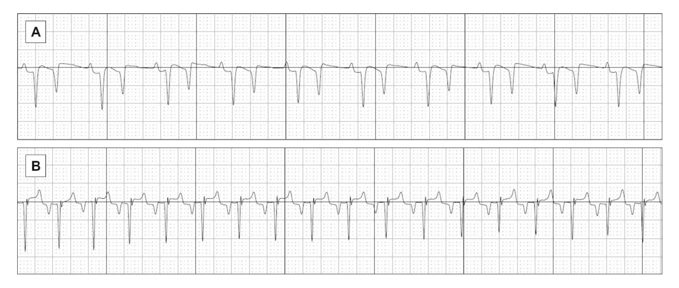
Fig. 3 Smartphone ECG tracings showing different P wave polarity in two foals of the study; positive polarity in (A) and negative polarity in (B). Paper speed = 25 mm/s and 20 mm/mV

was that the single-lead of the smartphone-based device is basically a precordial lead that assesses a different anatomic plane in comparison in lead I of the rECG, possibly leading to P waves of different amplitude and polarity.