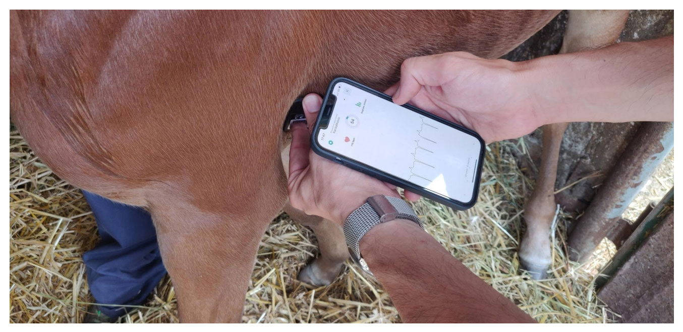
Fig. 1 The smartphone-based device was placed on the left chest wall, in the precordial area, slightly below the olecranon, with a dorso-ventral orientation of the device

Data were assessed for normality using the D'Agostino & Pearson test and the results were expressed as mean and standard deviation or median and range values.