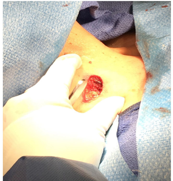
Fig. 3. Intra-operative image showing external jugular vein after resection of the aneurism.

EJV aneurysms are clinically rare compared to IJV aneurysms. Recent trauma, cardiovascular disease and age are reported to be the highest significant clinical risk factors in the formation of JVA [4]. The absence of trauma in our patient is noteworthy because it eliminates a direct contributor to a normally low-pressure vessel. It is also unclear as to whether the patient's recently diagnosed hypertension may have played a role in the etiology of this exceptionally rare condition.