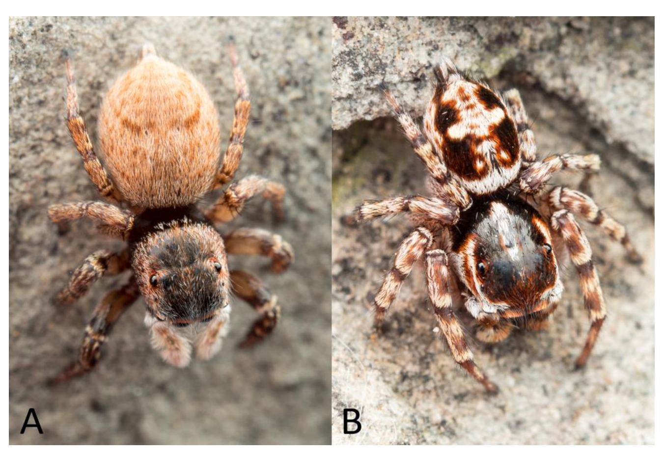
Figure 1. Habrocestum graecum, habitus (A-B). A: adult female; B: adult male.

by di Caporiacco. On the other hand, H. latifasciatum is recorded in Puglia (di Caporiacco 1951, Kritscher 1969, Hansen 2005). in South-Eastern Italy, showing an interesting trans-Ionian distribution. Trans-Ionian and trans-Adriatic distribution patterns have been observed for vertebrate (Blain et al. 2016) and invertebrate taxa (Gridelli 1950, di Caporiacco 1951, Jesse et al. 2009, Çiplak et al. 2010, Korábek et al. 2014, Schifani and Alicata 2019, Hinojosa et al. 2021). This is most probably a result of quaternary land bridges connecting Southern Italy with the Balkans and/or of the Miocenic fragmentation of the Aegeis land (Schifani and Alicata 2019). In the present work, we report about the first observation of the once Greek endemic spider species Habrocestum graecum Dalmas, 1920 in Italy and provide the first genetic characterization of the species via DNA barcoding (Figure 1).