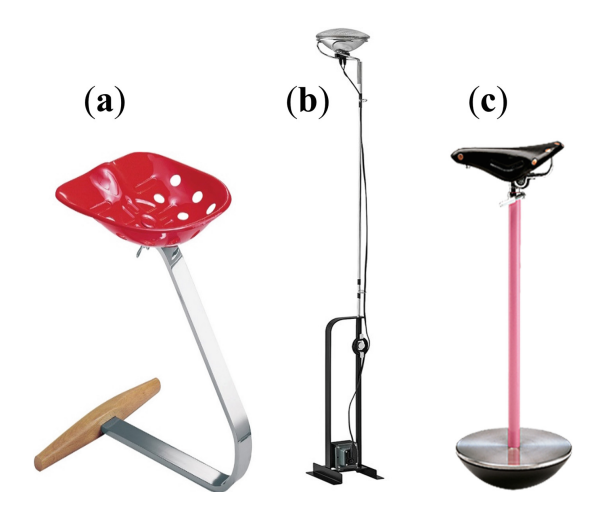
Fig. 1. Images of (a) Mezzadro stool [12]; (b) Toio floor lamp [13]; (c) Sella stool [14].

origin from different industrials sectors, this could enable closed-loop material flow over multiple life cycles.