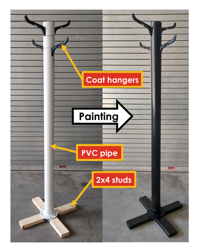
Fig. 3. Assembly of coat rack prototype.

hooks from coat hangers as the hooks, but that was changed to utilize the entire hanger. The final coat rack assembly is shown in Fig. 3. It was tested and found able to support a 9 lb. load on each hook, comparable to the capacity of a similarly sized conventional coat rack of 11 lbs. Thus, the prototype is capable compared to its conventional counterpart.