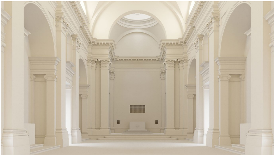
Fig.1 Hypothetical reconstruction of the church of Santa Margherita as designed by Agostino Barelli in 1685, Bologna

Barelli's project probably never saw the light, or at least it is highly probable that it was widely modified due to financial difficulties already started during the great plague of 1630 [Alessio 2015], which threw the building sector into a crisis that saw its worst period in 1700. In fact, a new document by Barelli depicting a much more modest plan and section for the same church datable only one or two years later (ca.) would reinforce this hypothesis. It is also probable that in later times the church was enriched with new altars of which we have a few drawings and sketches made by Angelo Venturoli in 1782 and 1792. For this reason, the 3D