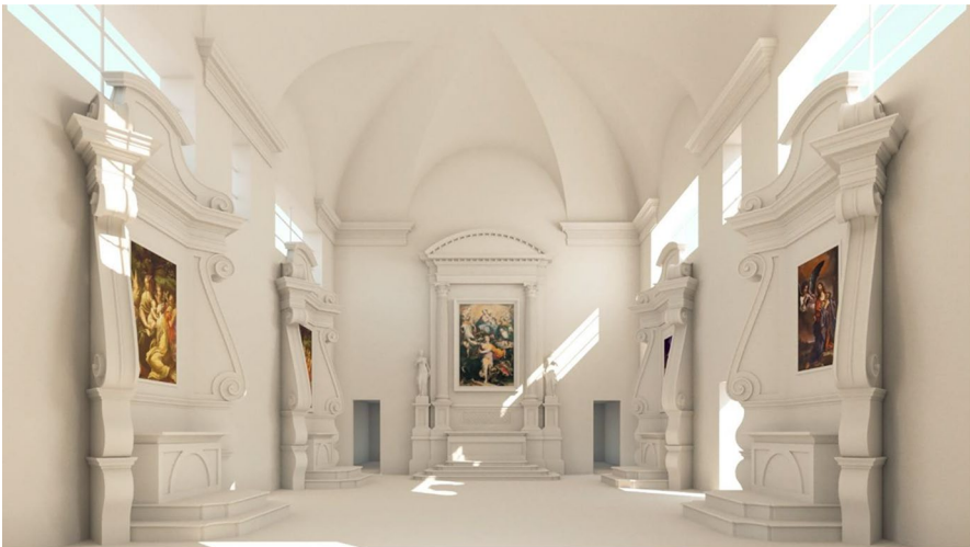
Fig. 2 Hypothetical reconstruction of the church of Santa Margherita variant as designed by Angelo Venturoli in 1792, Bologna

The 3D reconstruction process aimed to reproduce the church as it was in 1816 when it housed the important public exposition curated by Antonio Canova regarding the showcasing of several important paintings reclaimed from the French. The 3D model of the building was constructed starting from the 3D point cloud