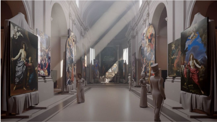
Fig. 3 Hypothetical reconstruction of the church of Spirito Santo as it might have been during the exhibition curated by Antonio Canova in 1816, Bologna

captured through a laser scanning campaign. The 3D point cloud was then imported into CAD software and used as a reference to produce the ideal mathematical model (Fig. 4). The reconstruction was requested by the Pinacoteca of Bologna [Pinacoteca Nazionale di Bologna 2021] and was aimed to visualize the layout of the disposition of the paintings at the historical exhibition by Canova, thus the architecture was not the main object of study. However, the process of reconstruction was an opportunity to study the geometrical proportioning, dimensioning and composition of the architectural elements of the church. As often happened in buildings from the Renaissance onwards, it was observed that the church was designed following a rigid modularity system that used as the base module the width of the Ionic pillars. Since the object of study was the event held inside the church, the reconstruction focused only on the interior of the building.