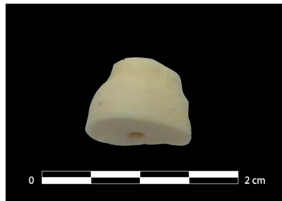
Figure 2. The apex part of the tooth root collected for the DNA extraction.

The fragment of the tooth was first cleaned on its surface with sodium hypochlorite solution (2%) using a sterile brush and then decontaminated with UV irradiation for 20 min. Dentine was removed along the root by powdering the internal surface with a 1.2 mm spherical drilling bit, and discarding the powder from the pulp chamber.