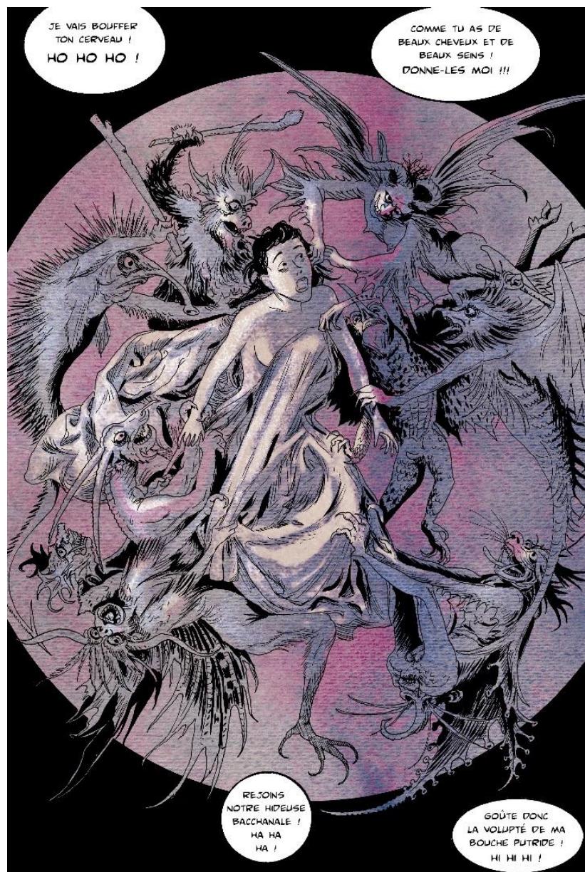
Figure 1: Baloup, Clément, Little Saigon, 2nd edition, La Boîte à bulles, 2016, p. 221.