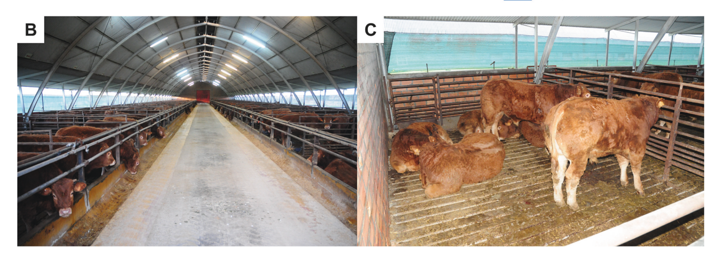
Fig. 1. Beef intensive commercial fattening unit. A, Schematic representation of the unit. B, Image of the barn where the study was performed. C, Image of one pen.