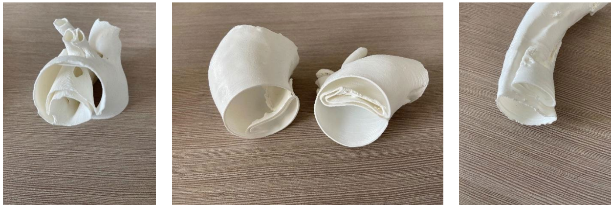
Figure 4. 3D printed models in three distinct sections