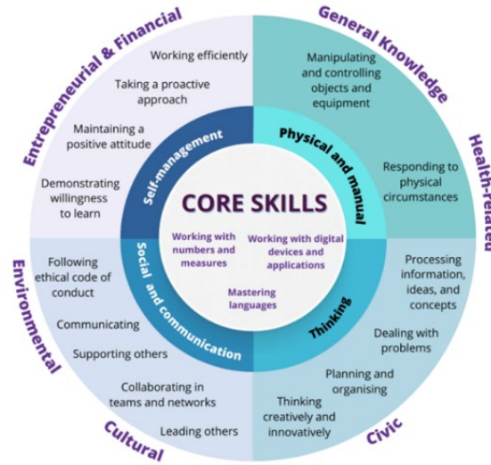
Figure 1. Graphical representation of the TSC model. Adapted from Hart et al., 2021