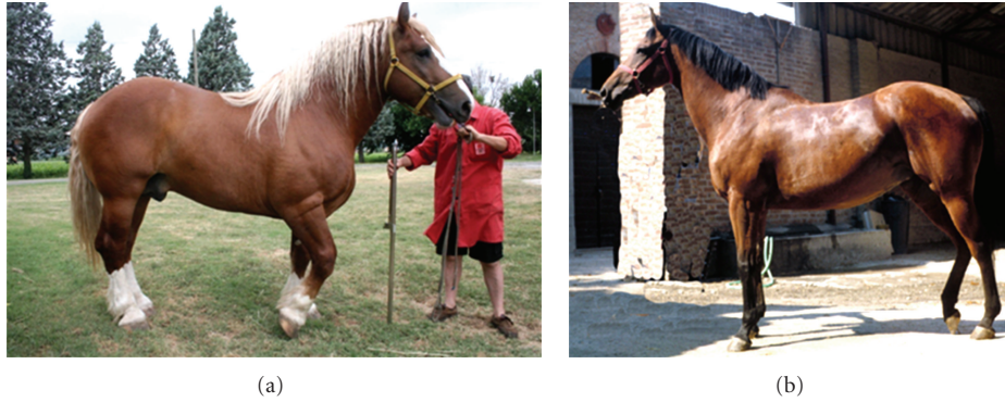
FIGURE 1: Horses of extreme and opposite morphological types: (a) Rapid Heavy Draft (brachymorphic type or heavy) and (b) Italian Trotter (dolichomorphic type or light).

In horse ( Equus caballus ), only few studies examined the MSTN gene so far. Hosoyama et al. [22] isolated and sequenced an MSTN cDNA from a Thoroughbred horse and Caetano et al. [23] mapped this gene to equine chromosome 18. Mutations in the equine MSTN gene have been identified only recently in Thoroughbred breed [24].