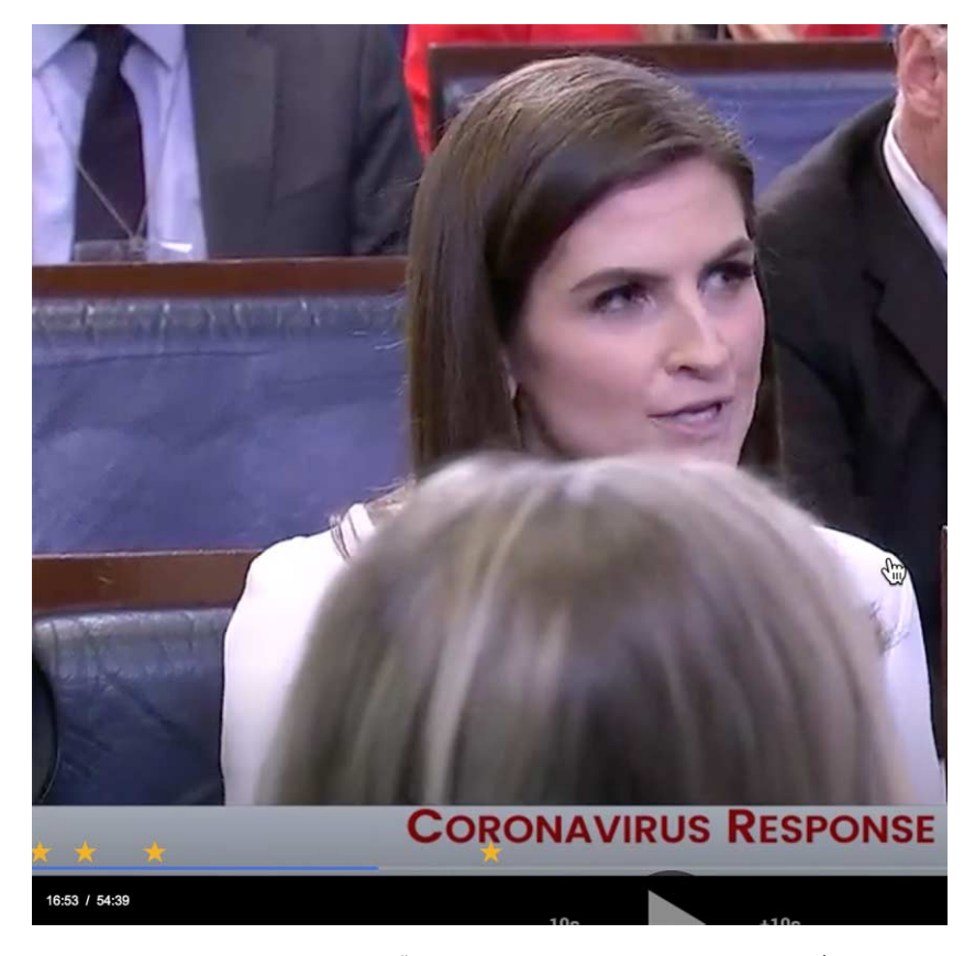
Figure 6. Reporter Kaitlan Collins: "Do you want to revisit that statement?".

Trump: No, that's not under control for any place in the world. . . . (TC 17:28)