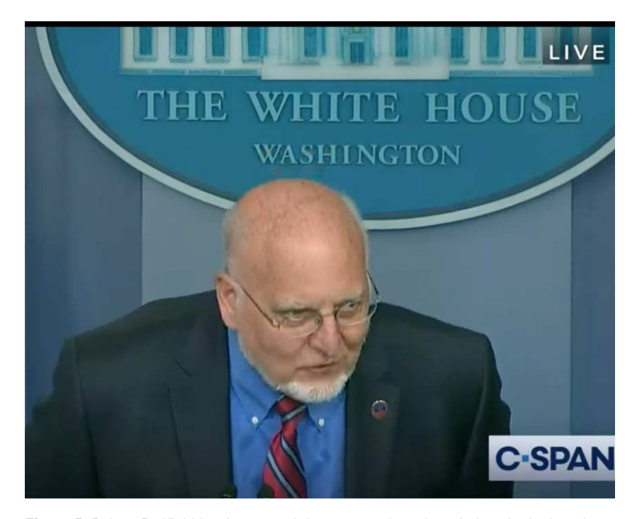
Figure 5. Robert Redfield bowing toward the press as he acknowledges he had not been misquoted.

Eventually, Redfield gave in and slightly bowing toward the journalist (fig. 5) had to admit that he had not been misquoted: "I'm accurately quoted in the Washington Post as 'difficult.'" But he insisted in adding that: "the headline was inappropriate."