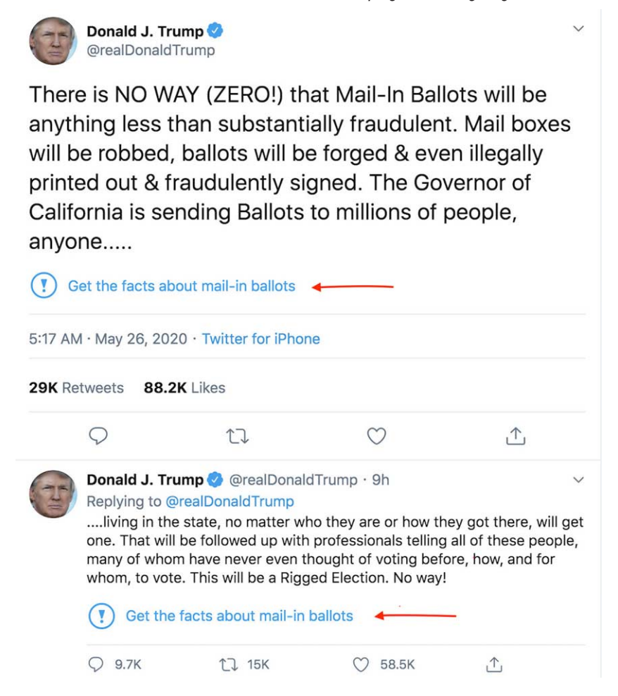
Figure 2. Twitter's fact-checking label

Trump's responses were predictably enraged. On the evening of May 26, he posted abrasive reactions to Twitter intervention: "Twitter is now interfering in the 2020 Presidential Election. They are saying my statement on Mail-In Ballots, which will lead to massive corruption and fraud, is incorrect, based on fact-checking by Fake News CNN and the Amazon Washington Post," and "Twitter is completely stifling free speech and I, as President, will not allow it to happen!"