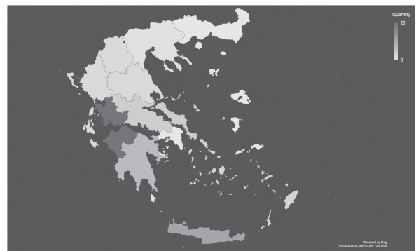
Fig. 4. Choropleth map of Naue II type swords in peninsular and insular Greece (13th to 11th c. BC centuries BC) sorted by modern regions (see appx.). Drawing by R.F. Peixoto.

In this paper, we have tried to suggest how a focus on human activities can benefit reflection on human mobility, complementing approaches based on biogeochemistry and aDNA that have attracted much interest in the wake of the ‘third science revolution’ in archaeology. Such an interest would involve a reconciliation of approaches in a critically vigilant and politically aware perspective on the public impact of archaeological interpretation. The archaeological concept of