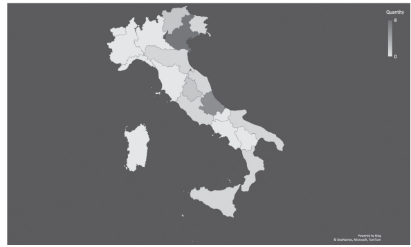
Fig. 3. Choropleth map of Cetona (left) and Allerona (right) type sword in Italian peninsula (13th to 11th c. BC centuries BC) sorted by modern regions (see appx.). Drawing by R.F. Peixoto.

Klauss now in Patras and Athens National Museum) have been used by scholars to argue for local workshop tradition 35 . However, morphological features of this kind are insufficient to decide between imported or locally made artifacts and they could suggest a different pattern of mobility related to a diffusion-trade nexus of finished products or post-casting procedures between the areas.