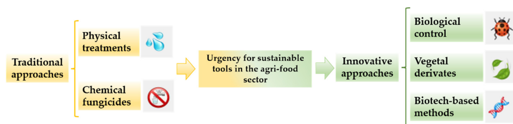
Figure 2. Approaches for post-harvest anthracnose management. Traditional strategies (yellow panels) and innovative methodologies explored for the improvement of the sustainability in the agri-food sector (green panels).

After a brief insight into the methods traditionally applied for the management of anthracnose disease, this review will revise the most important alternative and eco-friendly approaches that have been recently explored to counteract anthracnose, with a special focus at their possible application at post-harvest stage. Particular attention will be given to recently developed biotechnology-based strategies, that offer high specificity and low risk of negative effects on environment and human health (Figure 2).