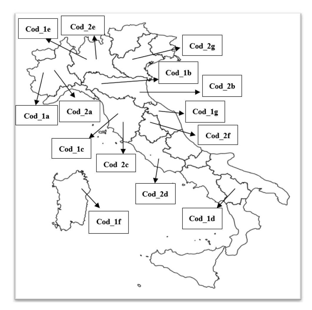
Figure 1. Location of the farms from which the different field population of Dermanyssus gallinae tested were sampled.

were collected by the farmers from 4 to 5 different nests of mites located in different points of the poultry houses (in nests, perches, and ravines) or directly on the chickens at night. During mites' feeding, using small brushes, directly place 150 mL airtight containers. The containers were subsequently sent to the laboratory. The identification of the mites was performed morphologically, according to the key suggested by Di Palma et al. [29]. For 2 mites samples (Cod_1f and Cod_2d) from 2 different region, Sardinia and Lazio, the susceptibility test was not immediately performed, and mites were maintained in vitro for a maximum of 3 days, following the method described by Nunn et al. [30].