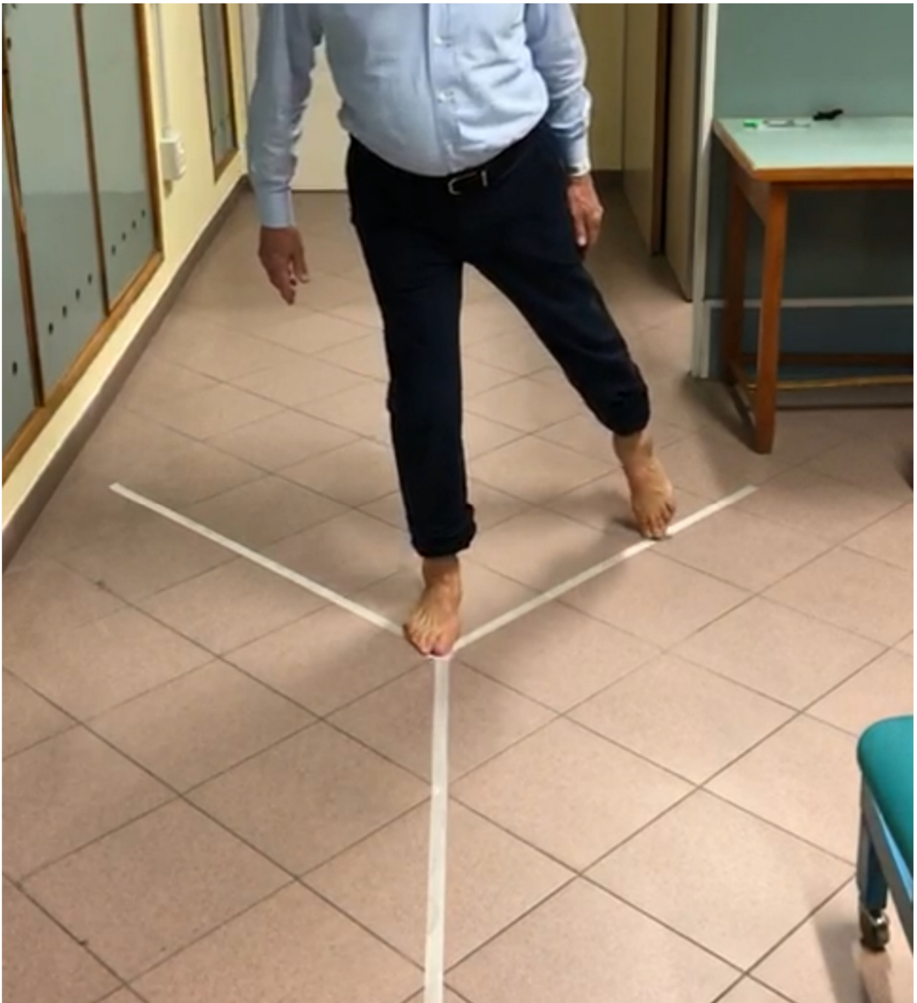
Figure 3. Y-Balance Test.