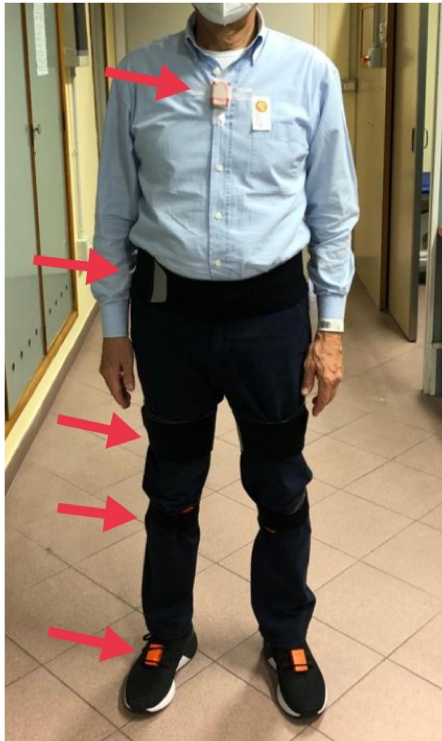
Figure 5. Positioning of the inertial motion sensors.