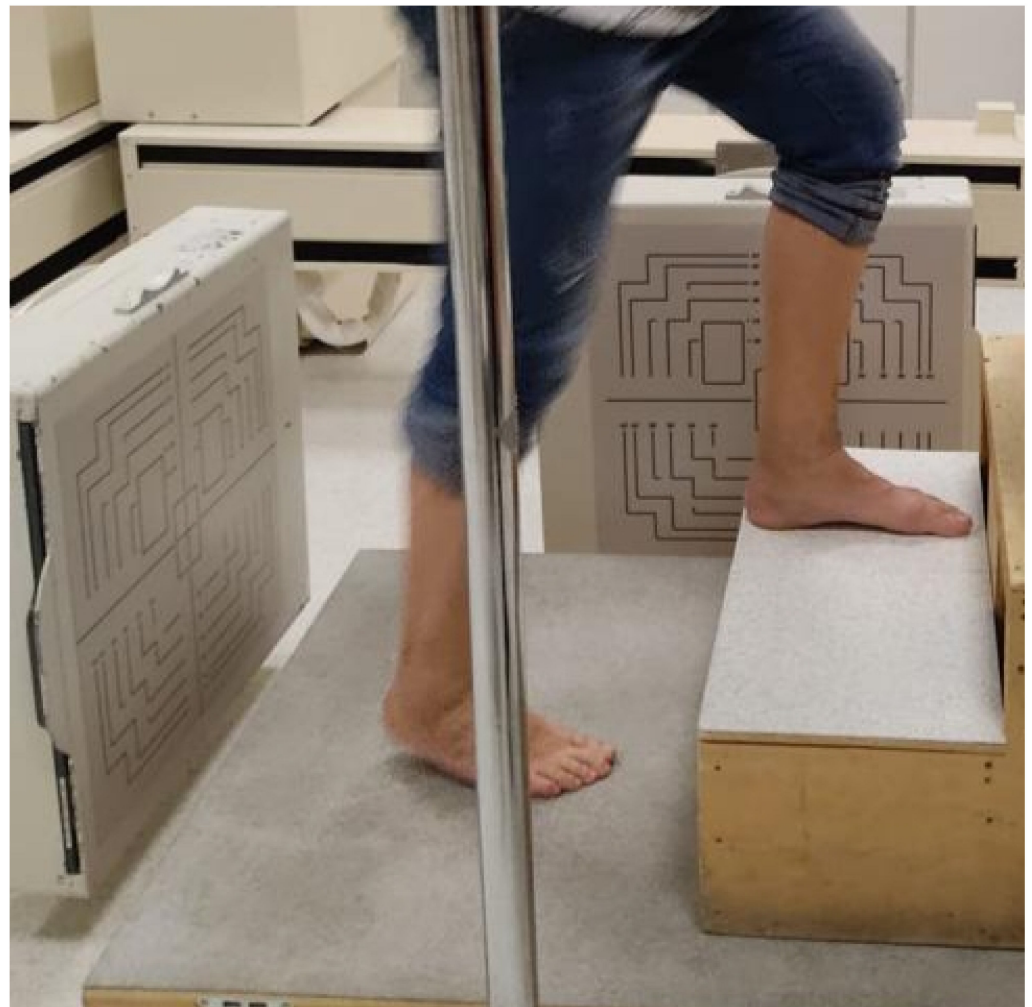
Figure 2. Radio-stereometric fluoroscopy, showing orthogonally positioned X-ray detectors while climbing a step.

The RSA technique in dynamics exploits the same principle of operation as the static system but, unlike the latter, can obtain, in a patient in motion, a series of radiographic frames in sequence (acquisition speed set at 8 fps) in two projections, which are captured simultaneously, orthogonally, and in a single detection (Figure 2).