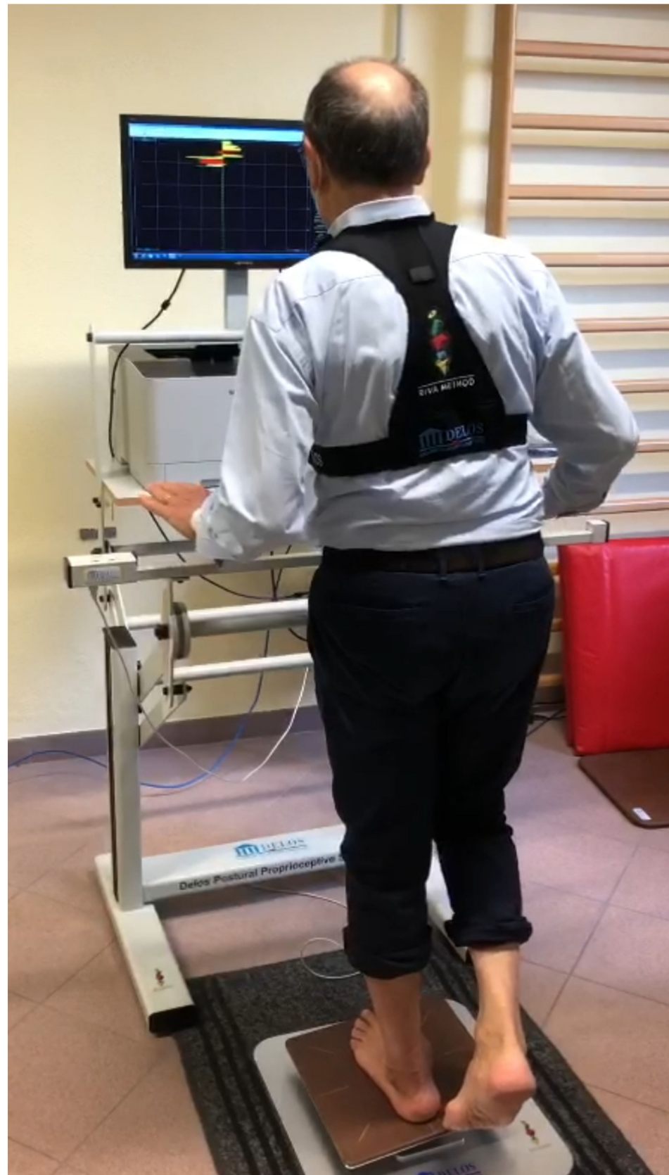
Figure 4. Dedicated Delos workstation.