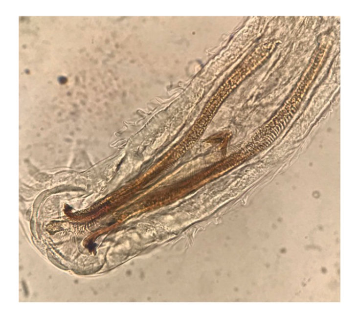
Fig. 2. Protostrongylus oryctolagi: tail of adult male.

Obs = number of examined hare; sd = standard deviation; Min-Max: minimum and maximum number of parasites per hosts).