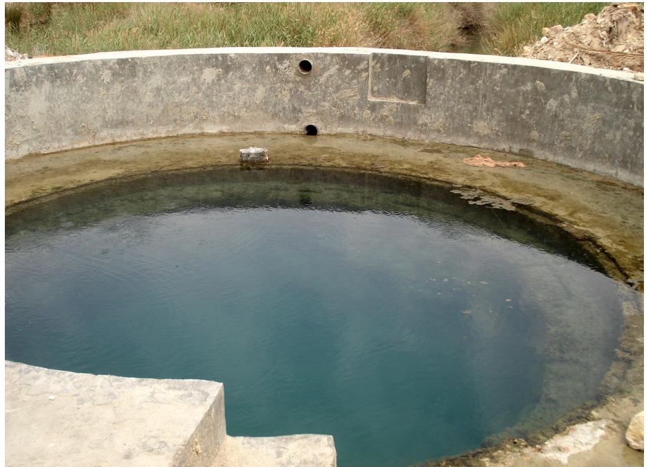
Figure 1. Landscape view of the springhead of Ain Pirizi in the Siwa Oasis, the Western Desert of Egypt.

(refractive index = 1.74). Light (LM) and scanning electron microscopy (SEM) observations were conducted at the MUSE – Museo delle Scienze, Limnology & Phycology Section, Trento, Italy, using an Axioskop 2 microscope (Zeiss, Jena, Germany) equipped with an Axiocam digital camera, and a LEO XVP electron microscope (Carl Zeiss SMT Ltd., Cambridge, UK) at 10 kV on gold coated prepared material, respectively. To assess the relative abundances of the dominant and subdominant species, 400 valves were counted. Measurements of the morphological and ultrastructural features were conducted on 24 different specimens representative of the size-diminution series. As concerns L. normaniana , identification followed Wahrer et al. (1985), and terminology for valve morphology Round et al. (1990). For the identification of the dominant and subdominant species we used (Krammer and Lange-Bertalot 1991; Moser et al. 1998; Cantonati et al. 2017). The slides and prepared materials are deposited at the Phycology Unit (No. 341), the Botany Department, Faculty of Science, Ain Shams University, Cairo, Egypt, and the MUSE.