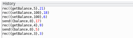
Figure 4. History after roll receive of message 22

and 26 are concurrent and can arrive in any order, which is the bug we were looking for. This can also have been checked by observing that we can replay the release of mutual exclusion (by sending the correspondent message and having meManager receive it) without the need to replay the receive of the setBalance . This shows another advantage of causal-consistent reversibility (w.r.t. mainstream reversible debuggers which linearise the execution): it keeps and uses causality information which can highlight missing synchronisations, like in this case, or undesired dependencies.