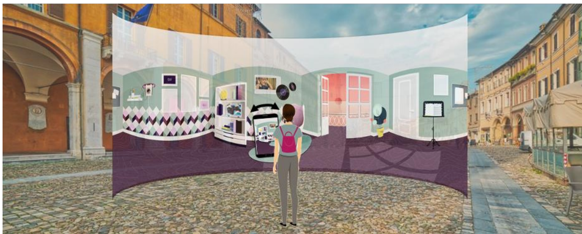
Figure 3: A representation of the 360° VR room experience with the Cesena city in the background