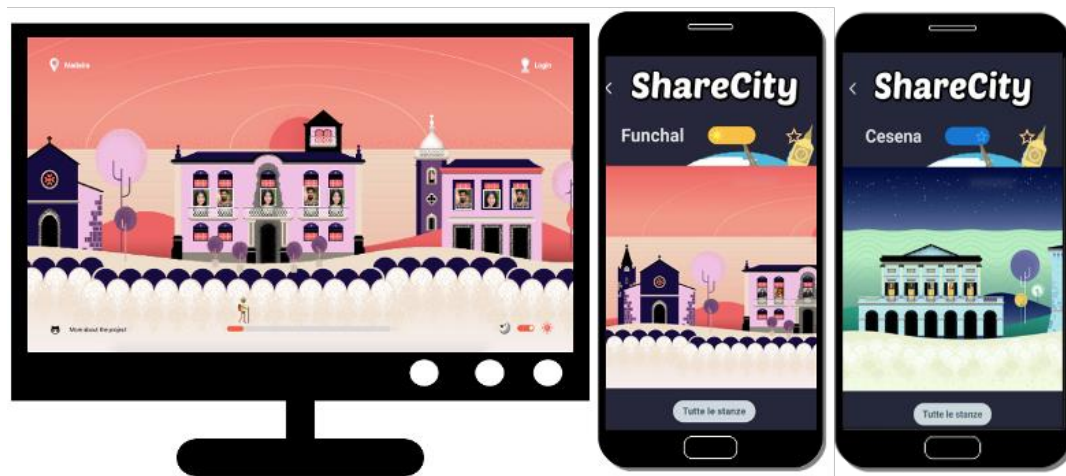
Figure 1: The desktop-based web app (on the left), and the mobile app (on the right).