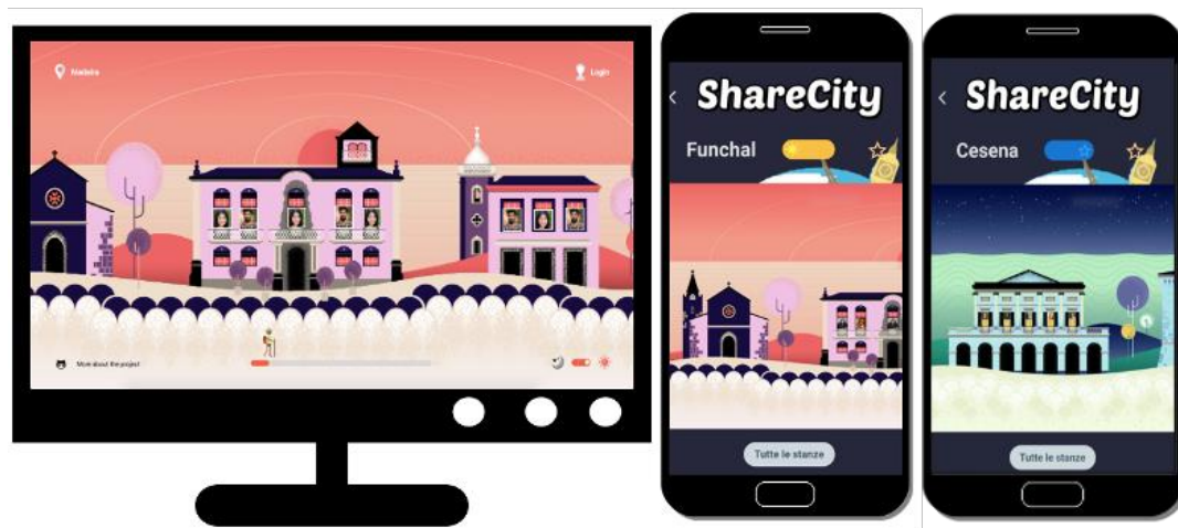
Figure 1: The desktop-based web app (on the left), and the mobile app (on the right).