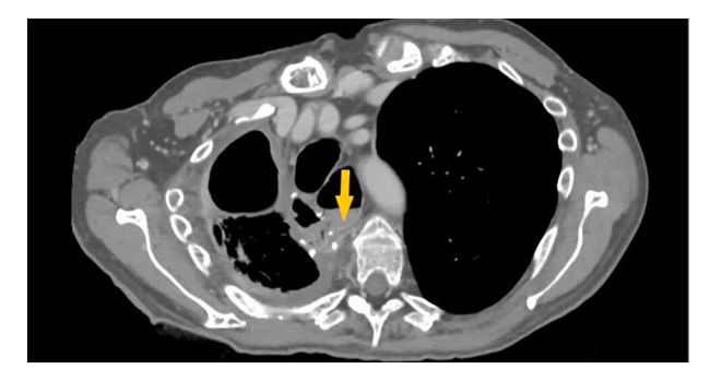
Fig. 1. Postoperative CT scan showing leak of CE.

Anastomotic dehiscence is a complication that can occur with up to 30% frequency and, in unstable patients, can lead to death. In acute,