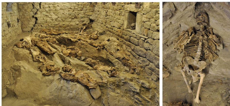
Fig. 1 Left: crypt of the Roccapelago church, which houses twelve of the best preserved mummies. Right: SU23-id49 as it now appears inside the museum