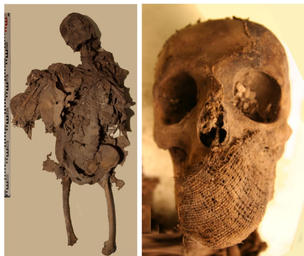
Fig. 2 Left: SU23-id49 in the position in which the subject was found inside the crypt. Right: textile residue of the shroud adhered over the face, which covered most of the mummies of Roccapelago

The subject of this study is an adult individual (SU23-id49) whose skeleton is almost complete, with the exception of missing tibiae, fibulae, and bones of the feet. This individual is partially mummified, with mainly ligaments and tendons preserved, along with fragments of epidermis and muscle tissue from the chest, skull, and arms. The subject's clothing, which was well preserved and remained largely intact in anatomical position, was dated to the late eighteenth century based on stratigraphy and archaeological findings (Fig. 2).