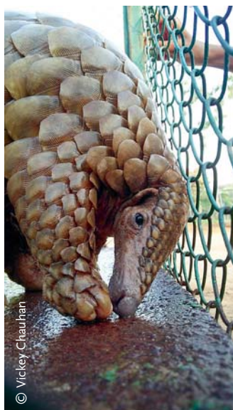
FIGURE 2: In Asia, wet markets sell live animals including wildlife like snakes, bats, civets and the endangered pangolins trapped illegally in South-east Asian forests.