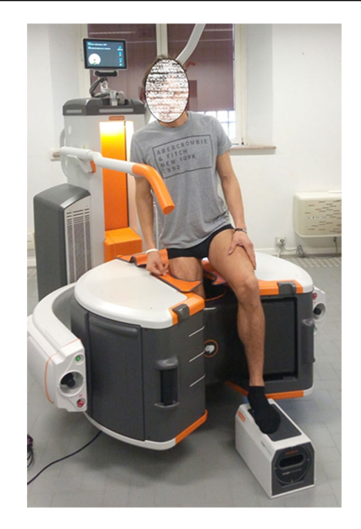
Fig. 1 Picture taken from one typical patient during scan with the CBCT in weight-bearing

Descriptive statistics were calculated for patellofemoral measurements. Paired t test stratified by rater were used to compare these patellofemoral measurements obtained from conventional CT versus CBCT scans. One-way analysis of