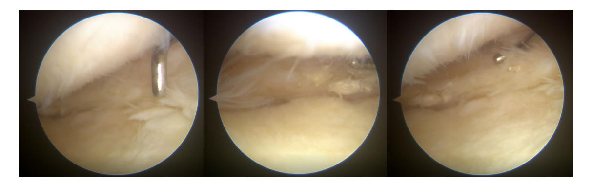
Fig. 1 Arthroscopic images of a second look of the patient 7. This patient underwent partial medial meniscectomy 37 years ago at the age of 21. In 1999 the patient underwent ACL reconstruction combined with medial CMI implantation. During the surgery, a chondrop-

athy grade II was already reported. There was evidence of mild cartilage degeneration at the last follow-up, while the CMI showed good integration with the host tissue and no tears were detected