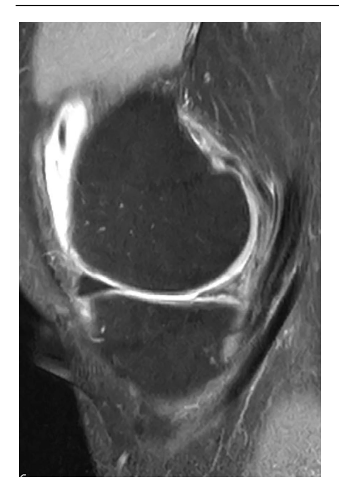
Fig.4 Sagittal MRI of patients 3 at 20 years of follow-up. Note that the implant is still recognizable and showing a good signal with reduced scaffold size

measured in the medial compartment. Unfortunately, it was only possible to fill the defect with an undersized 40 mm scaffold. Interestingly, the clinical scores improved significantly and remained excellent in the first 2 years after surgery, while a progressive decrease of the PROMs was recorded at 6.8 years of follow-up. A subsequent rapid worsening of the symptoms was noted at a longer follow-up and a TKA was implanted 13 years after the index surgery.