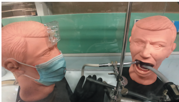
Figure 3. The two phantoms inside the chamber are shown. On the right the patient phantom is situated, having the air-turbine and HVE tip fixed in the same position throughout all experimental runs, as if operated by a right-handed dentist and dental assistant. On the left, the operator phantom equipped for the first experimental run, with a surgical mask and the first target fixed with double-sided adhesive tape on its forehead. The external area of the mask to be assessed for viral contamination can be seen marked in red. In all runs, the chamber space between operator and patient was left free of materials and protruding gloves to allow for an even aerosol spread, similarly to clinical conditions.

of the lower right first molar. A universal laboratory holder was used to hold the air turbine and the HVE in the same position for the experiments' whole duration. The air turbine was positioned 2 mm away from the tooth surface and oriented towards the inner part of the dental arch, while the HVE tip was positioned on the opposite side of the tooth. The distance between the HVE tip and the turbine tip was 2 cm.