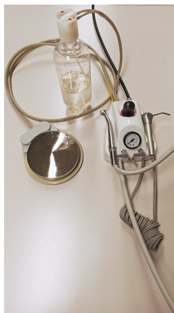
Figure 2. Presentation of the air turbine and control apparatus used in the present study. The pressurized water tank used to generate the air-water cooling spray for the turbine handpiece is seen on the upper part. The handpiece cord was afterwards inserted inside the chamber and sealed, for the turbine to operate inside the patient phantom.

Two phantom heads (operator and patient) were fixed to custom-made holders in a vertical position inside the chamber at a conventional working distance of 25 cm (Figure 3). The patient's phantom was equipped with resin teeth (Columbia Dentoform Corp., Long Island City, NYC, USA). The air turbine and the HVE were oriented to simulate a right-handed dentist's position during the preparation of the occlusal surface