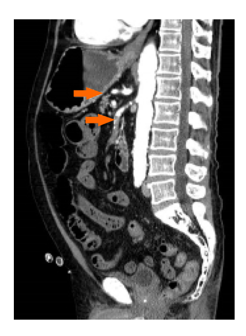
Figure 1 Abdominal computed tomography with intravenous contrast, sagittal scan showing thrombosis of the superior mesenteric artery and the common hepatic artery (arrows).

Colonoscopy has been proposed as a risk factor for colonic ischemia although only few reports are available in this respect[14]. To our knowledge, no current epidemiologic data exist about colonic ischemia after colonoscopy.