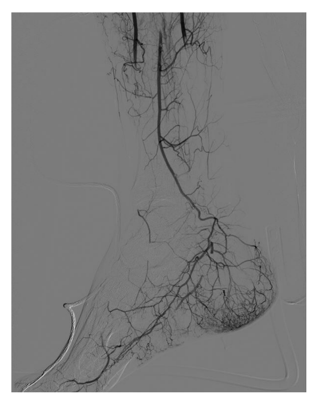
Fig. 1. Lower Limb Arteriography at presentation.

Two days after surgery, due to improved respiratory conditions, the patient was extubated, with pedal pulses still present and amelioration of the foot perfusion. At control CT-Scan, aortic thrombus disappeared (Fig. 2b).