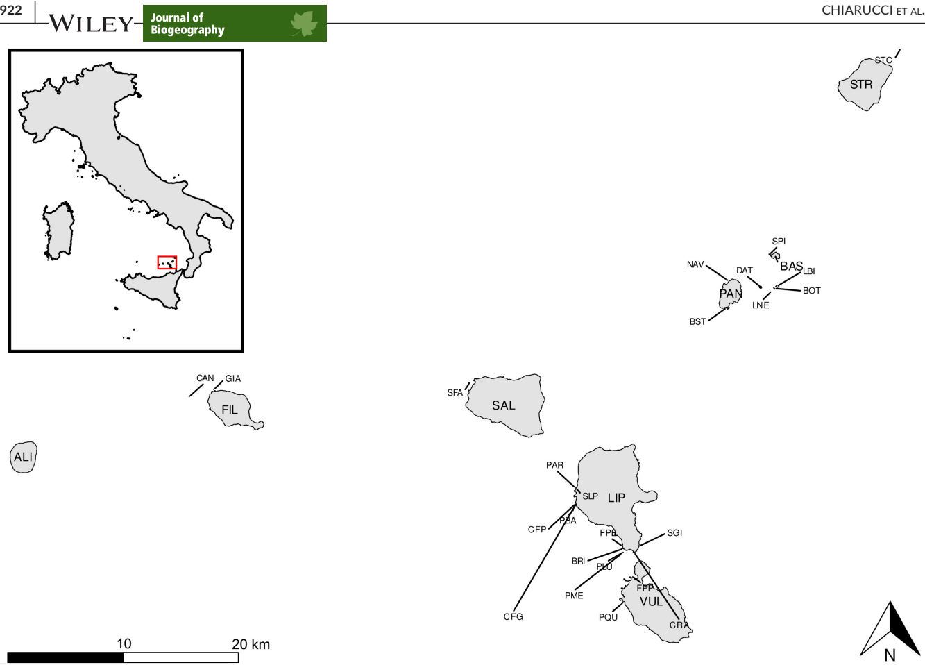
FIGURE 1 The Aeolian Archipelago, with the eight major islands and the 24 islets used in the present study. The acronyms identifying each island and islet are reported on Table S1

seamounts located west and north-west off the currently emerged Aeolian Islands, there is no evidence of the occurrence of other islands in the past (Beccaluva et al., 1985). Indeed, the Pleistocene sea level changes did not significantly affect the configuration of the archipelago with respect to the actual pattern, with Vulcano and Lipari being the only large islands which were connected during the glacial maxima.