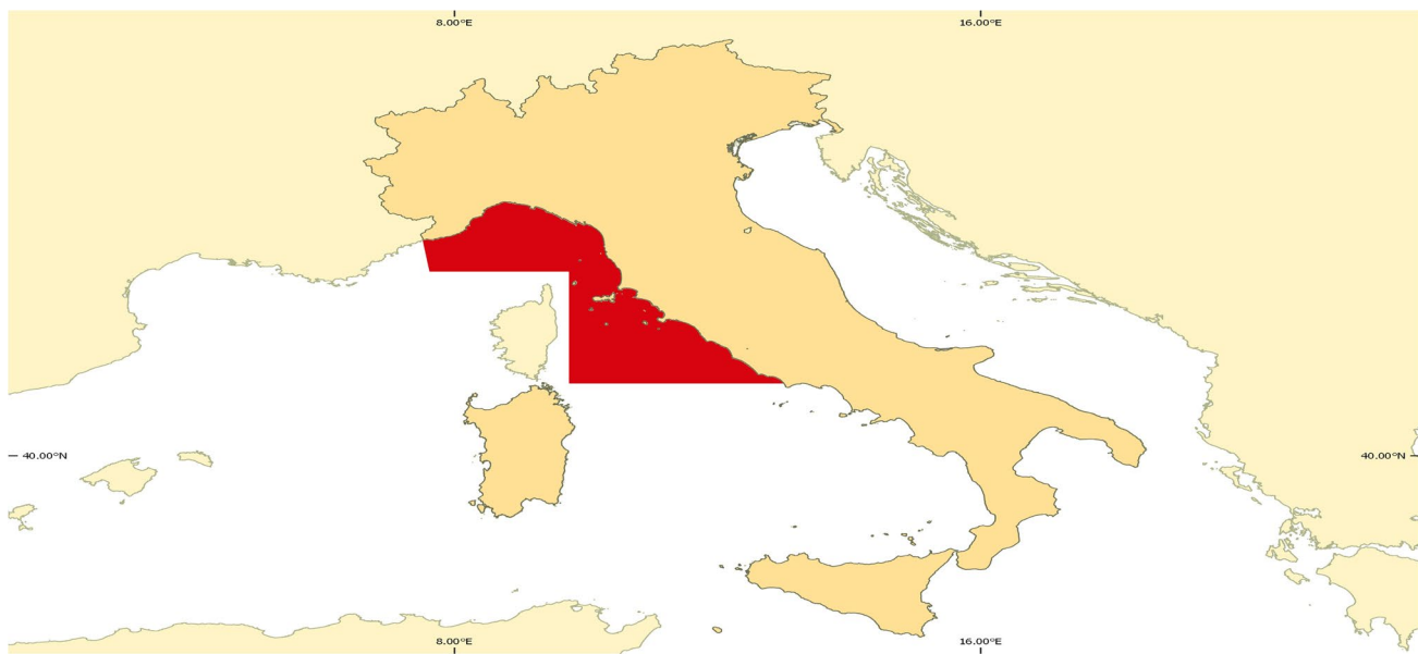
Fig. 1 Map of the study area in the Ligurian and northern and central Tyrrhenian Seas (FAO-GFCM GSA9)

Length–weight relationship was analyzed by means of the power equation W = aTL^b , where W is the total weight and TL is the total length. The Le Cren (1951) relative condition factor ( K_n ), expressing the condition of a fish in numerical terms, was calculated from the observed total weight and theoretical weight (EW, g) estimated from "a" and "b" parameters of the length–weight relation.