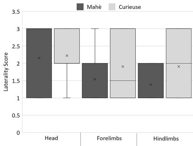
Fig. 4 Laterality Score of sleeping Aldabra tortoises on Mahè (under human care) and Curieuse (free ranging). Left-biased tortoises for the position of the head, or the limbs were assigned with a score of 1, tortoises with asymmetrical positions of the head or the limbs had a score of 2, right-biased tortoises for the position of the head or the limbs had a score of 3. The horizontal lines within the box indicate the medians, crosses indicate means, boundaries of the box indicate the first and third quartile. The whiskers extend up from the top of the box to the largest data element that is less than or equal to 1.5 times the interquartile range (IQR) and down from the bottom of the box to the smallest data element that is larger than 1.5 times the IQR. Values outside this range are considered outliers and are drawn as points

In the current study, the Aldabra giant tortoises observed during the day were found sleeping in the sleep-like posture described by Hayes and colleagues (1992) for the Galapagos giant tortoises, with forelimbs and hindlimbs sprawled on the ground (Swingland 1989), extended forward or backward. More than 60% of the study tortoises were found to sleep with the head, the forelimbs and/or the hindlimbs in an asymmetrical position, especially regarding the limbs (more than 80%). Indeed, the number of the tortoises observed during the sleep-like behaviour with lateral biases in head positioning was significantly more than tortoises