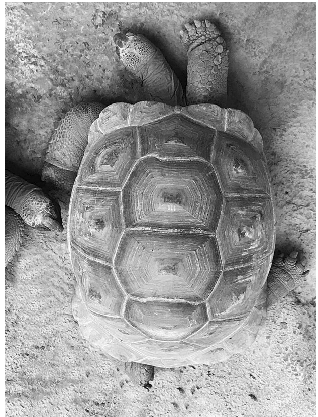
Fig. 1 Aldabra giant tortoise in sleep-like behaviour. In this picture, the tortoise is in sleep-like behaviour with the right forelimb and hindlimb extended forward, whereas the left forelimb and hindlimb are extended backward. The head is on the left of the body midline

The study was carried out sampling all tortoises during sleep-like behaviour on both Mahè and Curieuse and data were collected in February 2020. For each tortoise encountered that was performing this behaviour, side preferences in the position of the head, forelimbs and hindlimbs were collected. We chose locations that allowed us to optimize data collection, such as spots where several tortoises were present. We only sampled each spot/area once, to avoid the risk of recording several times the same tortoise. During the day, tortoises were considered in sleep-like behaviour if the neck was laying on the ground and the eyes were closed. In particular, Aldabra tortoises sleep in the open with head and limbs extended, sprawled on the ground (Swingland 1989) (Fig. 1). Based on our field observation, the head/