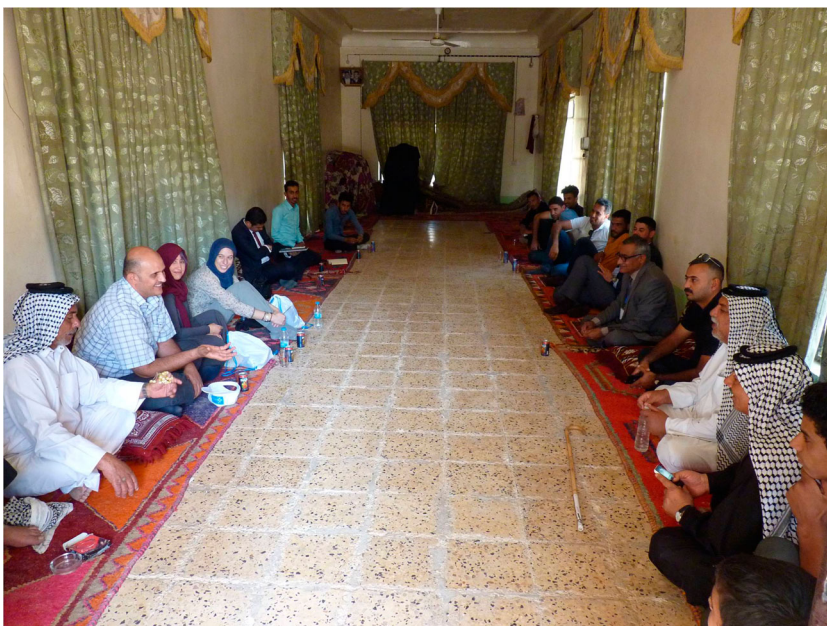
Figure 3. An interview in the village of Nahb close to the archaeological site of Nahb.

The community of reference is aware that archaeological sites are part of the national and regional Iraqi landscape. Most of the residents (Actor 1) interviewed were aware of the existence of archaeological sites near their houses. This evidence applies both to well-known sites with clear archaeological evidence (visible surface materials and structures), and to sites that are difficult to recognize on the ground. Furthermore, most of the interviewees (among Actor 1) are aware of the existence of other archaeological sites in the vicinity and more generally that the region is 'rich in archaeology'