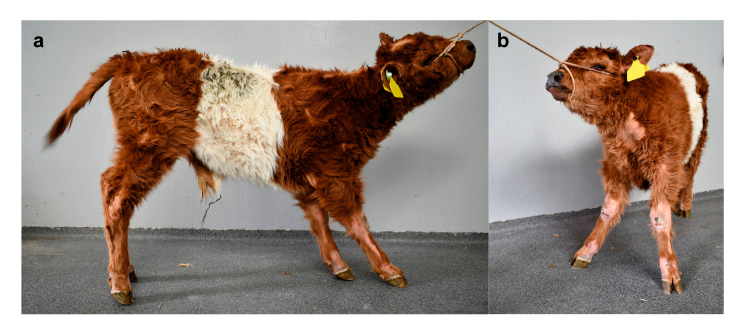
Figure 1. Congenital hypotrichosis in a Swiss Belted Galloway cattle. (a) Note the multiple areas of alopecia on the limbs and the dorsal part of the head. (b) Note the large alopecic lesions located on the neck and the dorsal aspect of the fetlock and carpal joints. Note also the excoriations on the dorsal aspect of the fetlock and carpal joints.

Complete blood count revealed mild erythrocytosis, hypochromia, thrombocytosis, and leukocytosis due to mature neutrophilia and monocytosis. Plasma biochemistry revealed mild hyperbilirubinemia, hypercalcemia, hyperphosphatemia, severely increased GGT activity, mildly increased GLDH and SDH activities, and mildly decreased BUN concentration. VBG analysis revealed mild hyperglycemia and hyperlactatemia (Table S2). The calf was confirmed to be negative for BVDV.